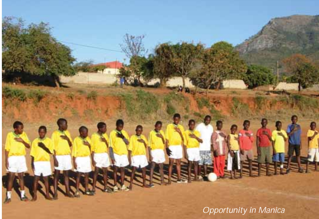
Opportunity in Manica

PROGRAMS ■ The following forms the core the activities, however due to GDM's nature and the dynamic exchange between community members, activities often include ad-hoc participation and interventions, from things like food supply and tree planting to local government capacity building and clean-up drives! The organic, holistic and relational approach always ensures (pleasant) surprises which are welcomed as learning opportunities.