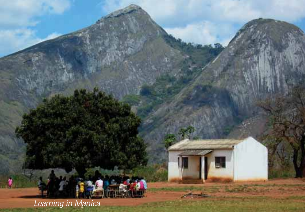
Learning in Manica