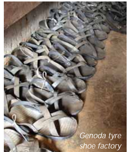
Genoda tyre shoe factory

Life-Skills | Leadership, teamwork, communication, HIV/Aids, substance abuse, conflict resolution, gender, children's rights, mentoring, decision making, project management and environmental care.